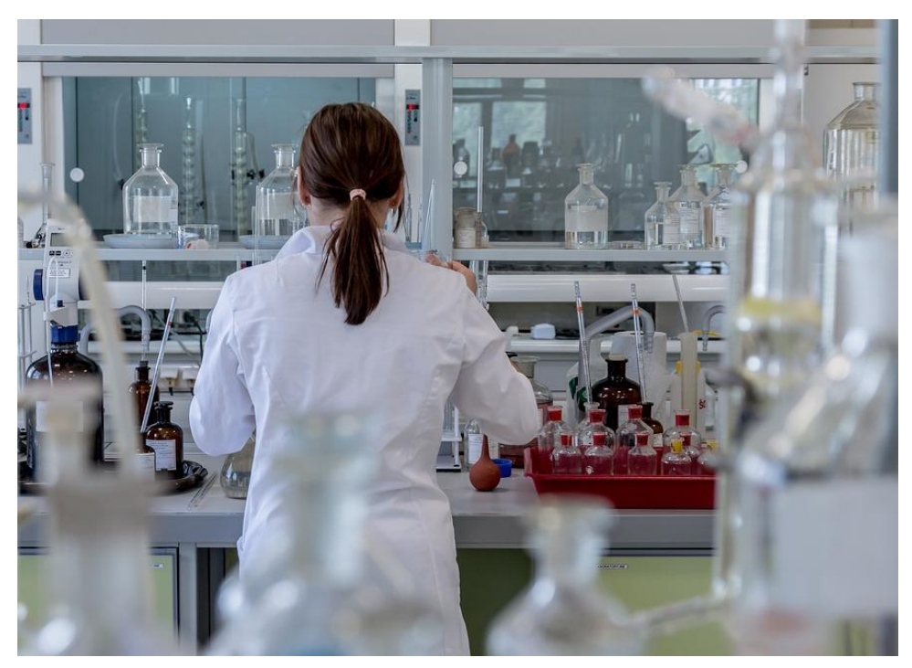
21st November 2018 / Helsinki, Finland